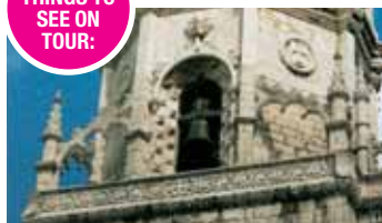
Torre dos Clérigos