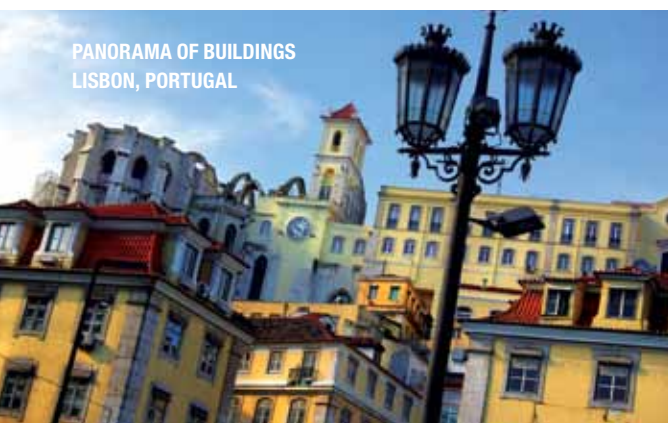
PANORAMA OF BUILDINGS LISBON, PORTUGAL