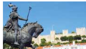
Castelo de São Jorge