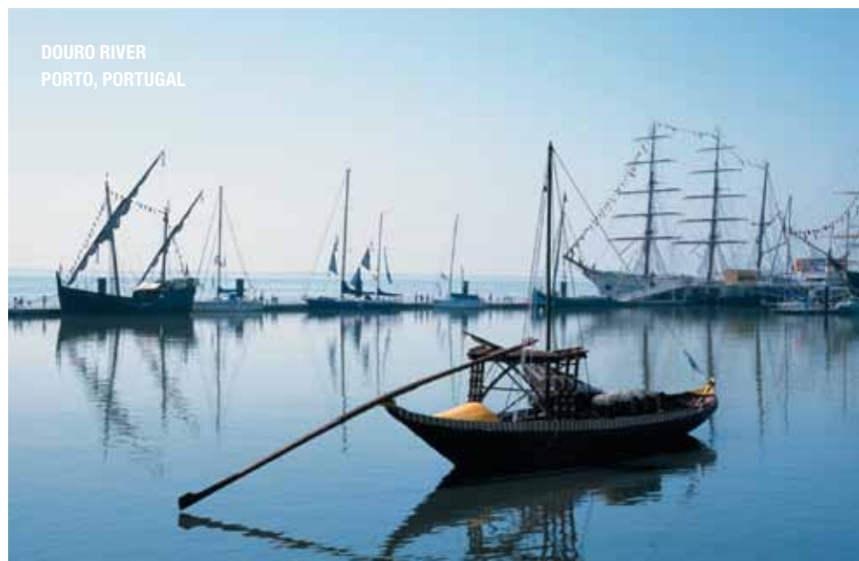
DOURO RIVER PORTO, PORTUGAL

PORTO | As its name seems to imply, Porto is a port city, clinging to the rocks carved by the river Douro. Port wine and Portugal itself were named after it. Discover both the cosmopolitan and old-world ambiance of Portugal's "second city", now a UNESCO World Heritage Site. See the remains of ancient city walls and the Oporto Cathedral, one of the oldest surviving structures there. Your tour includes a visit to the Torre dos Clérigos, a six-floor tower that rises 250 feet above the city. Climb 225 steps to the belfry for a breathtaking view of Porto and the Douro River. Finally, board a river boat for a short cruise through the Douro River Valley, famous for its steep-terraced vineyards.