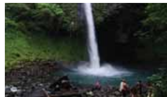
La Fortuna Waterfall