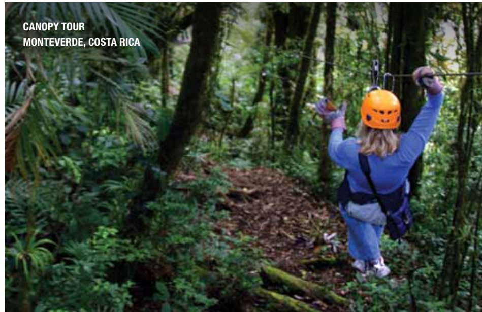
CANOPY TOUR MONTEVERDE, COSTA RICA

ARENAL | Get ready for an adventure to remember in Costa Rica's Arenal Region! Behold the perfect conical shape that emerges from the green hills of Alajuela: this is the fascinating Arenal Volcano. Overlooking the San Carlos plain and the Pacific lowlands, this mile-high volcano has been active for the past 7,000 years. You'll see the volcano from a different angle on your kayaking excursion. Not only does the volcano serve as a watershed for the lake, but it also provides thermal energy for the nearby hot springs. Relax in these naturally heated pools; then, walk to the bottom of the spectacular La Fortuna Waterfall.