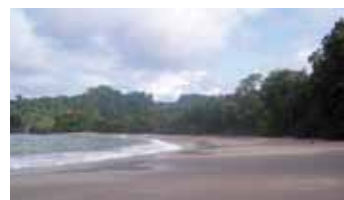
Manuel Antonio National Park