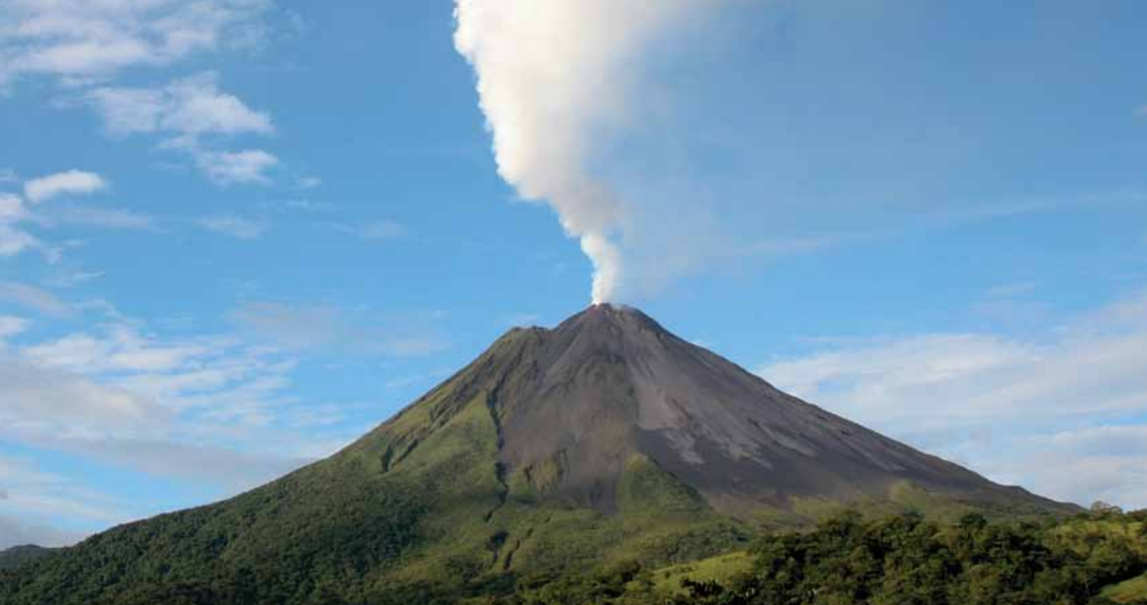
ARENAL VOLCANO ARENAL REGION, COSTA RICA