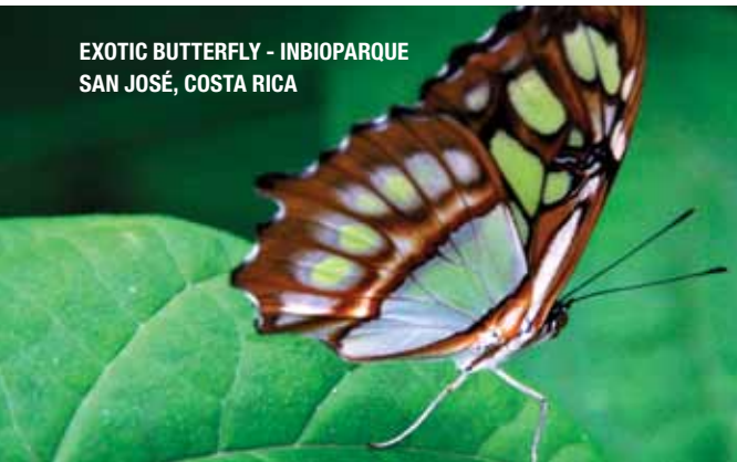
EXOTIC BUTTERFLY - INBIOPARQUE SAN JOSÉ, COSTA RICA