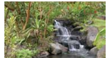
Arenal hot springs